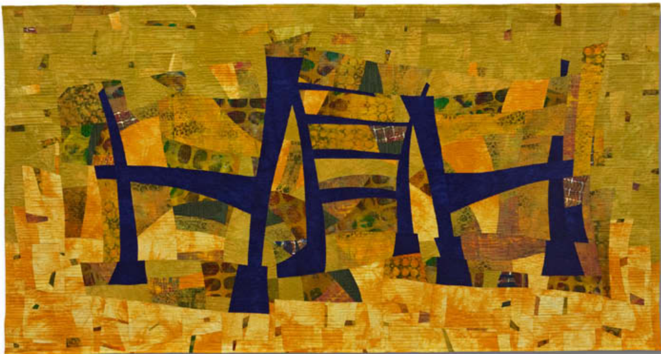
Balance 32 49 x 93 inches ©2010 Ann Johnston Contrast is used to give a sense of balance and of scale.

Texture: Upon close inspection, the texture varies because the quilting pattern changes to a distinctly different pattern in the blue figures. The quilting of the border varies slightly from the quilting of the center background, creating another different texture.